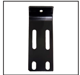
4. Mounting Brackets x 4