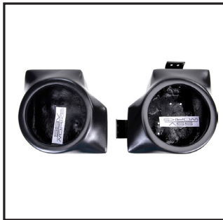
1. US-OSP65-U (1 pair)