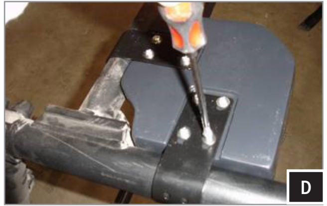
D. Place the enclosure into the overhead mounting location and using the #3 screwdriver install the brackets with the screws and washers provided.