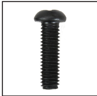
2. M6 x 1.0 Screws x 16