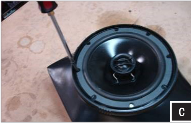
C. Connect and install the speaker into the enclosure (be sure to connect the “+” red speaker wire to the “+” terminal on the speaker and the “-“ black speaker wire to the “-“ terminal on the speaker) using the #2 Phillips screwdriver.