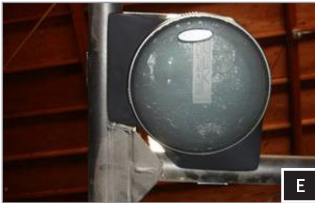
E. Route the speaker wires away from moving parts and any sharp metal, then connect to the amplifier.